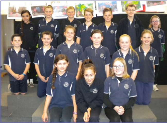
Our Festival of Music choir rehearse enthusiastically every Tuesday to prepare for their performance at Adelaide's Festival Theatre in September.